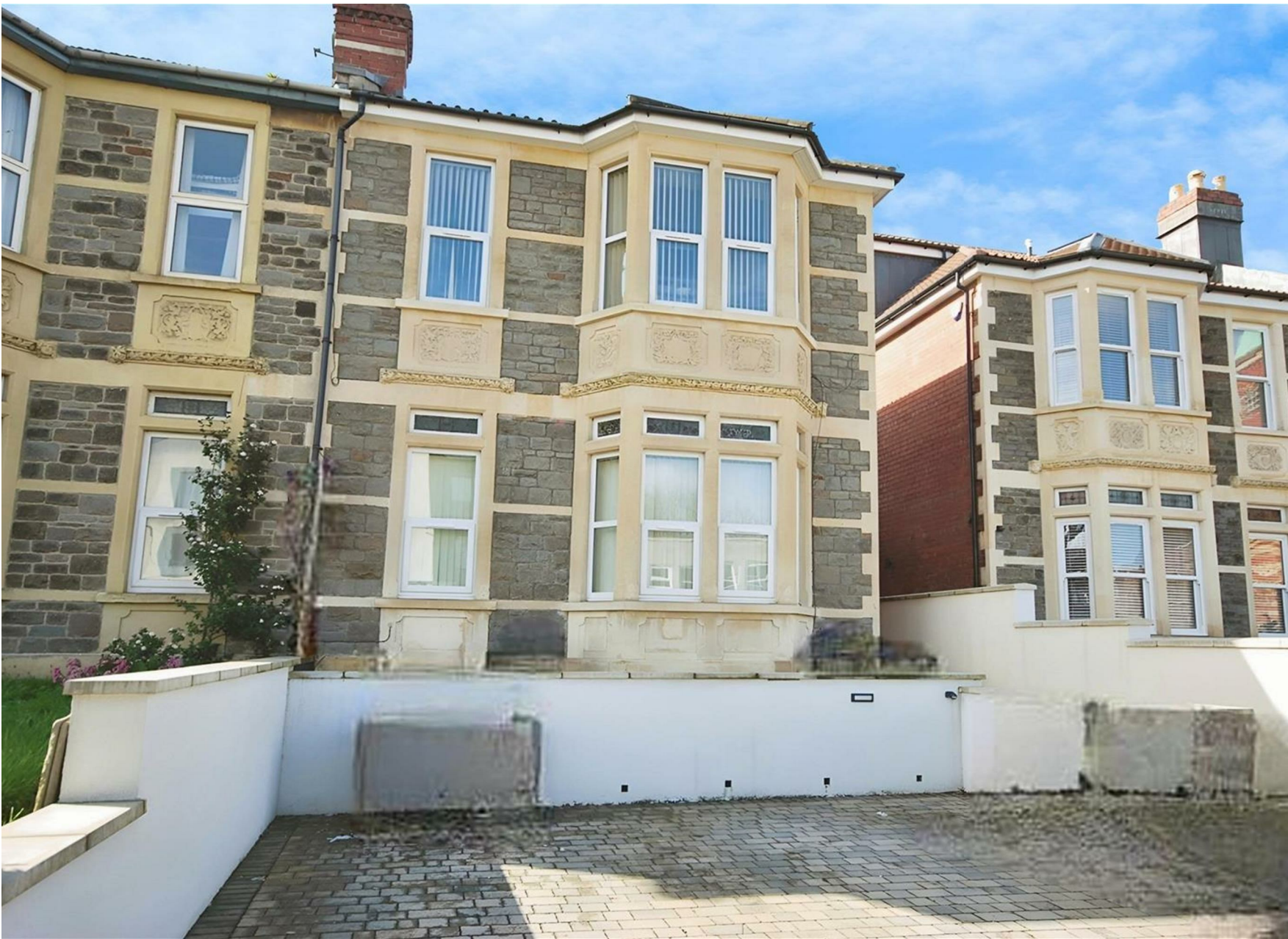
Flat 3 179 Wells Road, Knowle, Bristol, BS4 2DB £895 PCM